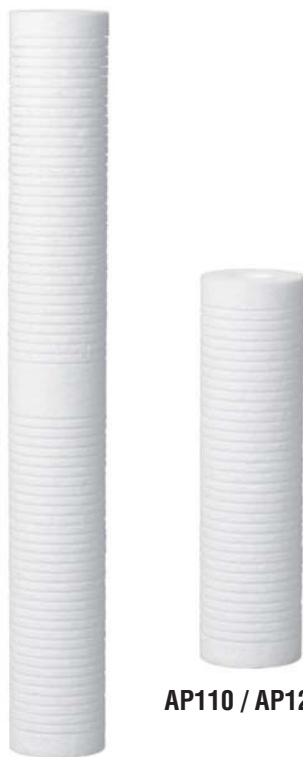
AP110 / AP124